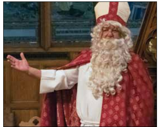
Wreaths were made at the Advent Advent-ure, St. Nicholas made a visit all the way from Myra, and a joyful noise was made caroling at the North Avenue MARTA station.