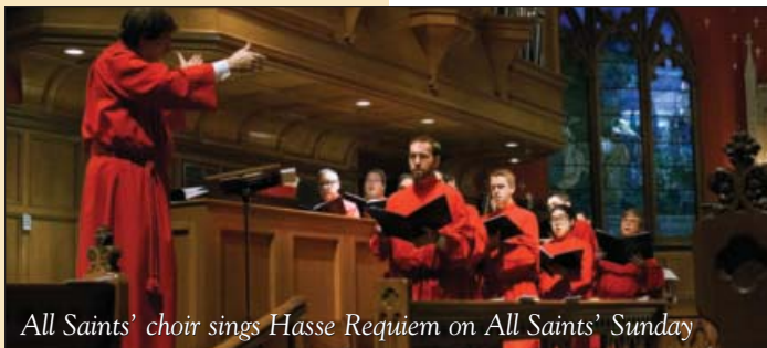
All Saints' choir sings Hasse Requiem on All Saints' Sunday

Baptisms 9:00 and 11:15 a.m. worship services in the church Advent Event 10:20–11:00 a.m. in Ellis Hall