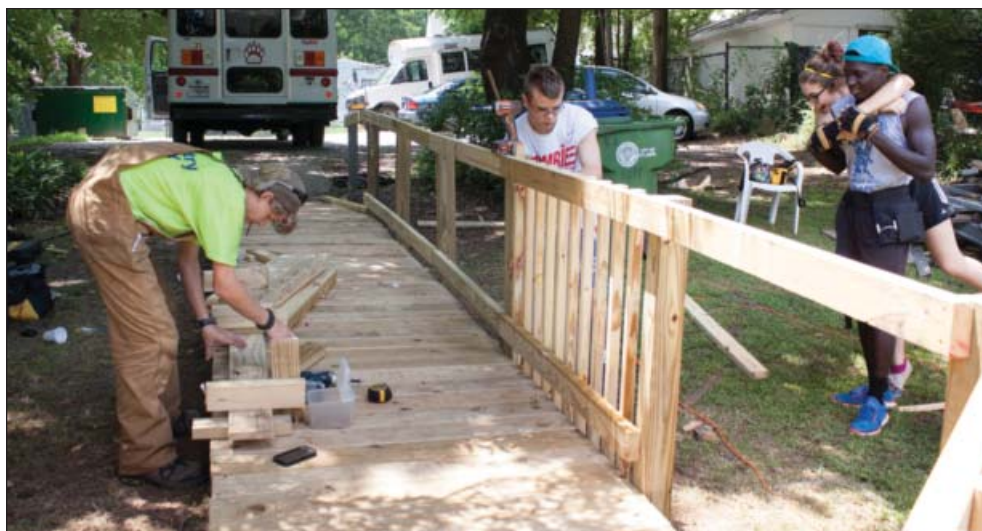
Above left: In July we rolled up our sleeves to do the good work of donating blood. Above right: Thanks to the capital campaign our courtyard began its transformation. Bottom: Our youth and youth from Holy Innocents spent a week the city to do good work on the youth mission, ATLServe.