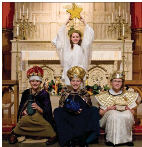
Top: We celebrated Epiphany with a service in the chapel, and then enjoyed a great Twelfth Night Wednesday Night Supper with crowns and King Cake.